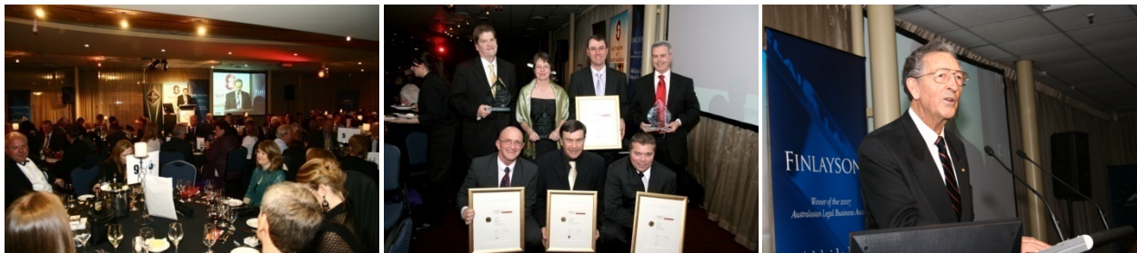
Scenes from the very successful SISA Awards Dinner in 2007

SISA is pleased to offer a range of sponsorship options, all of which will provide significant corporate exposure to the SISA membership and invited guests. This year we plan to build on the success of the 2007 event, which was attended by 240 people representing a wide cross-section of the business community, the public sector and the OH&S and injury management professions.