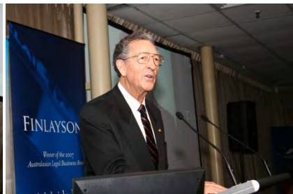
Scenes from the very successful SISA Awards Dinner in 2007

We already have over 430 expressions of interest for seats at the 2008 event. The enclosed material provides further information on the opportunities available for your company. As you will see, the sponsorship options allow for a range of marketing opportunities including the display and distribution of corporate literature and gifts, a speech opportunity and sponsorship at individual award levels, and the display of corporate logos on event documentation, menus and the like.