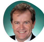
Hon. Bill Shorten MP Minister for Employment and Workplace Relations