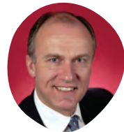
Hon. Eric Abetz Shadow Minister for Employment & Workplace Relations